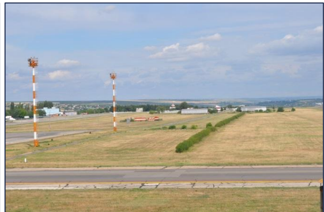
Figure 1. Open type biotopes in Chisinau airport.

The mammals were recorded by direct observations, according to the traces and trophic activity (carnivorous mammals) on routes ranging from 1 to 3 km. The small mammals were assessed with traps; 7,000 trap-nights were used and more than 300 animals were caught. The density of subterranean mammal species (mole and mole rat) was determined by direct observations and by count-