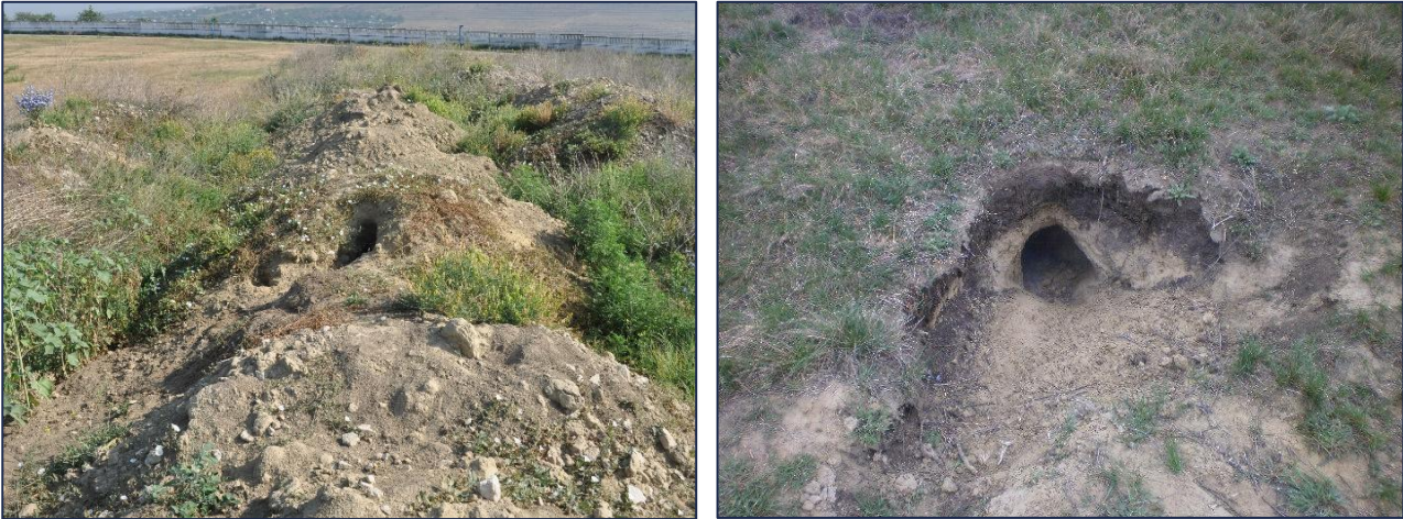
Figure 3. Mounds of sand and gravel with several fox burrows and a fox burrow in the south-western part of the airport.